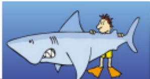
Man eating shark

Hyphens are used to avoid confusion being caused by certain words or phrases::