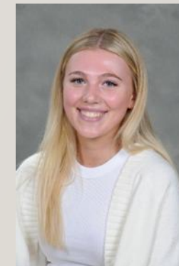
Miss White Apprentice